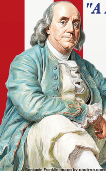
Benjamin Franklin