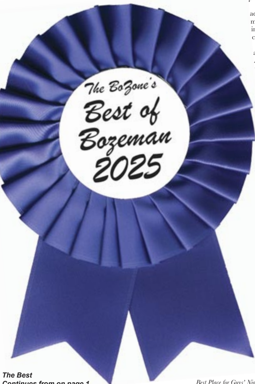
The Best Continues from on page 1