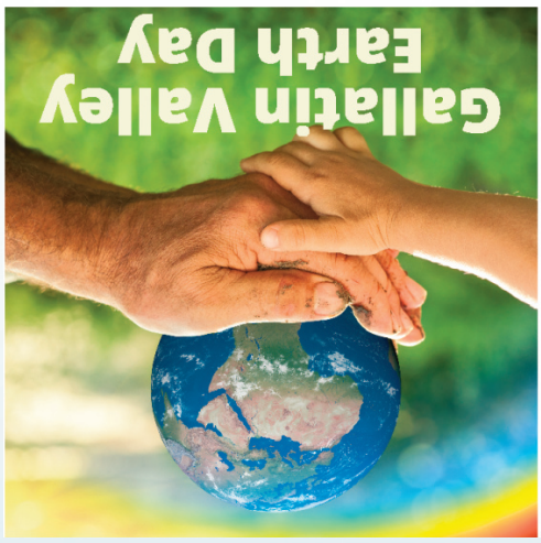
Don't Break It! – Native American Proverb

THE BROZ OWNER Entertainment & Events Calendar