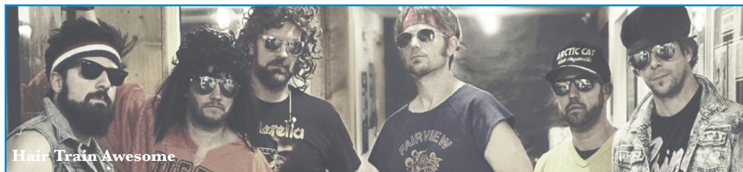
Hair Train Awesome

Nostalgic Gen X group Hair Train Awesome fronts the inaugural Heartbreaker's Ball on Feb. 11th. The Great American Heroes open the 9pm show. Move and groove to a soundtrack of '70s-80s pop and hair metal featuring this six-piece novelty project. This inaugural event is a place to cement your love addictions and fatal attractions!