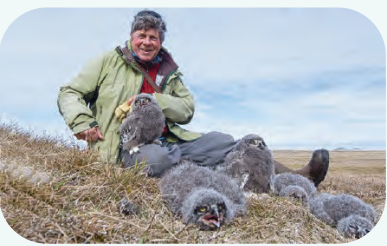
“Climate Change, Snowy Owls, & Arctic Ecosystems”– Denver Holt, December 12 at The Ellen Theatre