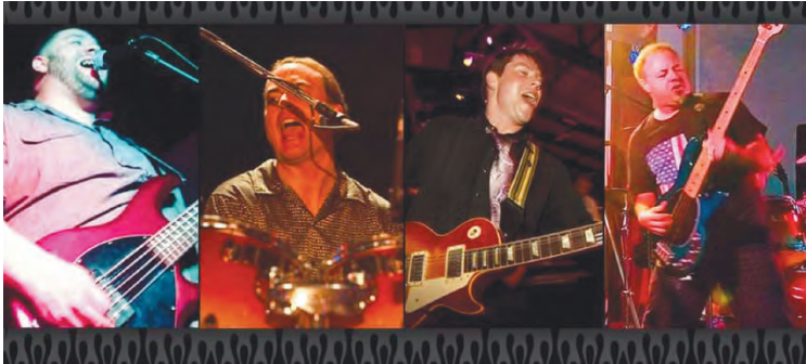
The Mighty Flick