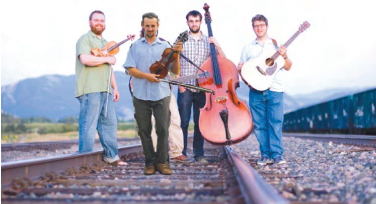
Bridger Creek Boys

support to conserve year-round recreational opportunities in Hyalite Canyon. Bobcat proud, Bridger Brewing provides the Bozeman community with unique hand-crafted brews, fresh artisan-style pizzas and more. Check them out at www.bridgerbrewing.com . •