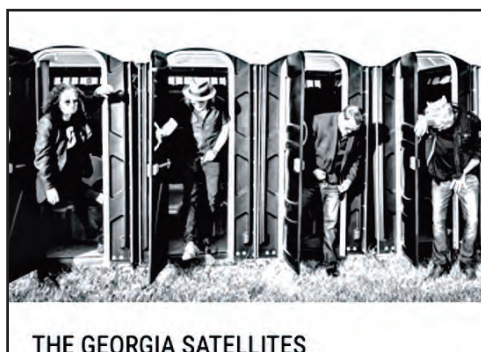
THE GEORGIA SATELLITES