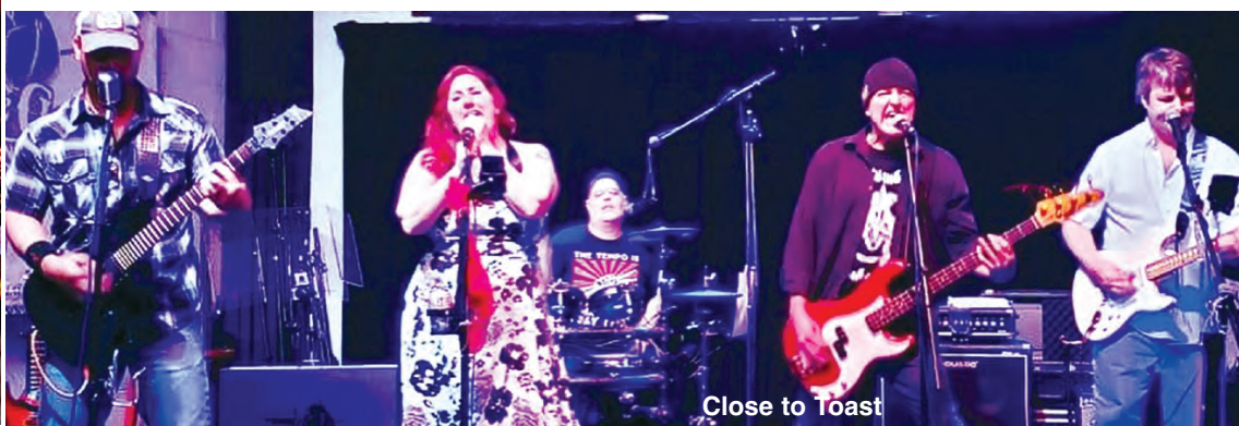
Close to Toast