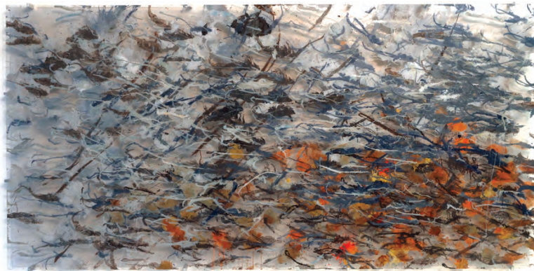
Gordon Lightfoot: If You Could Read My Mind