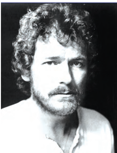
Gordon Lightfoot: If You Could Read My Mind

Also available until August 6th, Amulet features Imelda Staunton in a spine-chilling role. The film explores the story of Tomaz, an ex-soldier from an unnamed foreign conflict, living in strained circumstances in London. Haunted by his past, he is offered a place to stay in a decaying, claustrophobic house, inhabited by an enigmatic young