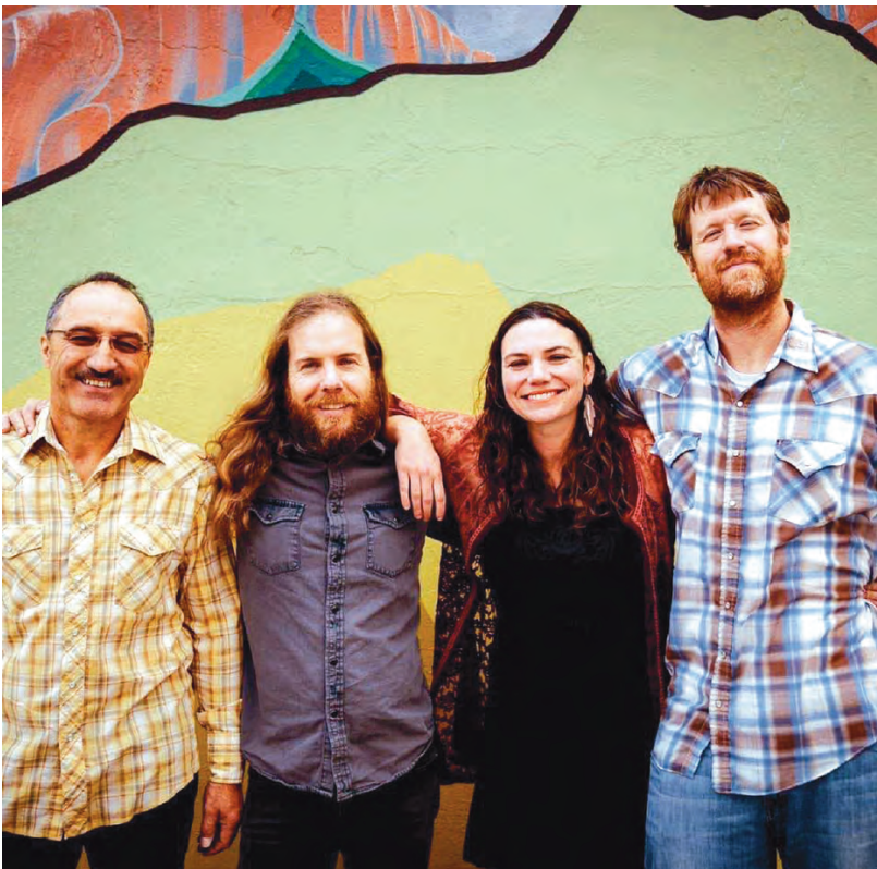
The Two Tracks