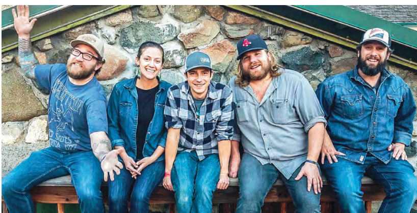
Laney Lou & the Bird Dogs

For more information about the virtual Music in the Mountains events, visit www.bigskyarts.org or find them on Facebook. •