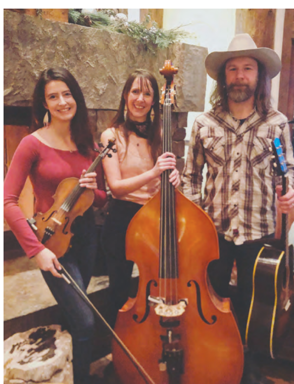
Honey & Rye

Proceeds from February 17th will benefit Child