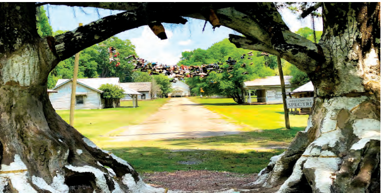
The city of Spectre in Big Fish

Livingston's Shane Lalani Center for the Arts is delighted to present the folksy fairytale Big Fish . Performances begin February 28th and run through March 22nd in the Dulcie Theatre. Based on the novel by Daniel Wallace and Tim Burton's acclaimed film, Big Fish tells the