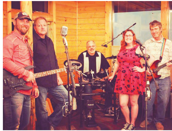
Close to toast

Bridger Mountain Big Band performs regularly on Sundays from 7–9:30pm. The 17-piece jazz orchestra celebrates the music of Duke Ellington, Count Basie, and more, with original arrangements and music of all genres from the 1900s to today. Check them out on