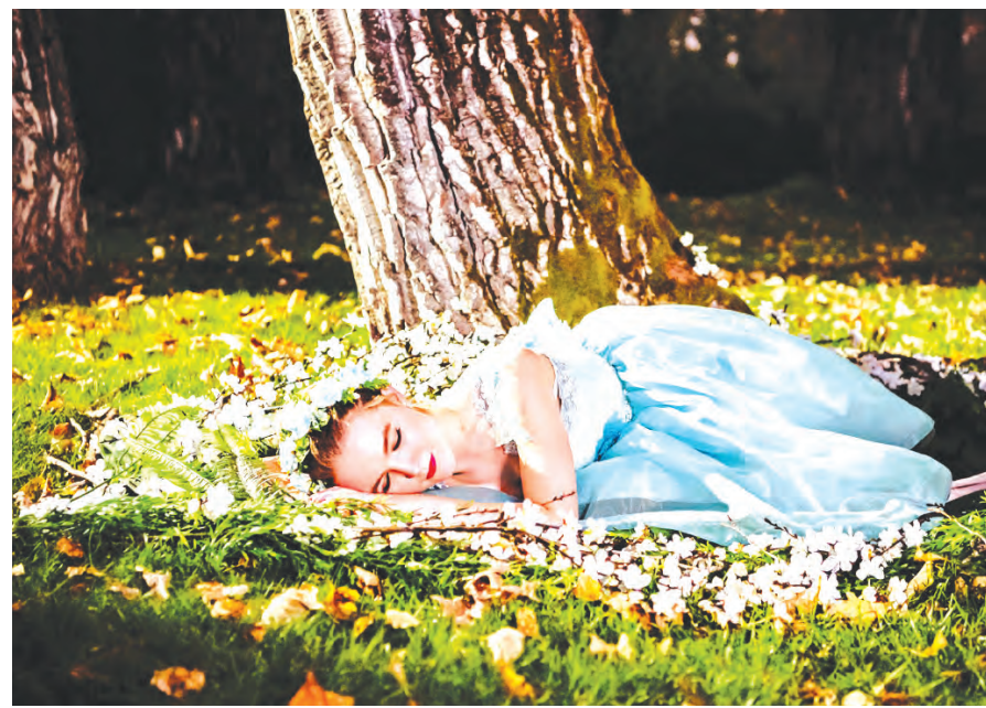
Titania in A Midsummer Night’s Dream

501(c)(3) nonprofit organization, produces quality performances,