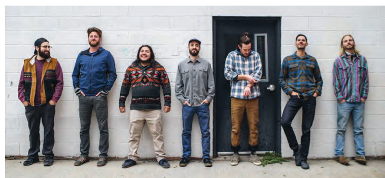
A Brother's Fountain

depend on the number of musicians who want to play. Sign-ups start at 5:30pm – first come, first served. Be sure to bring your friends and support live music in Bozeman! A modest contribution to the kitty will be divided by participating musicians at the end of the night. The