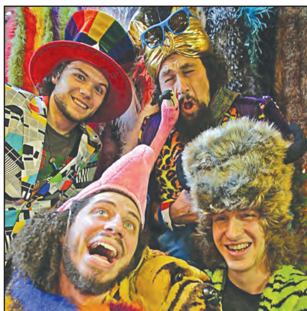
Pigeons Playing Ping Pong

Thriftworks offers his own uniquely original take on forward thinking electronic music, weaving eclectic samples and explosive modern bass that continually pushes the envelope while taking the art of beat-crafting to new heights. His use of deep low-end and wall-to-wall synths channel something ancient