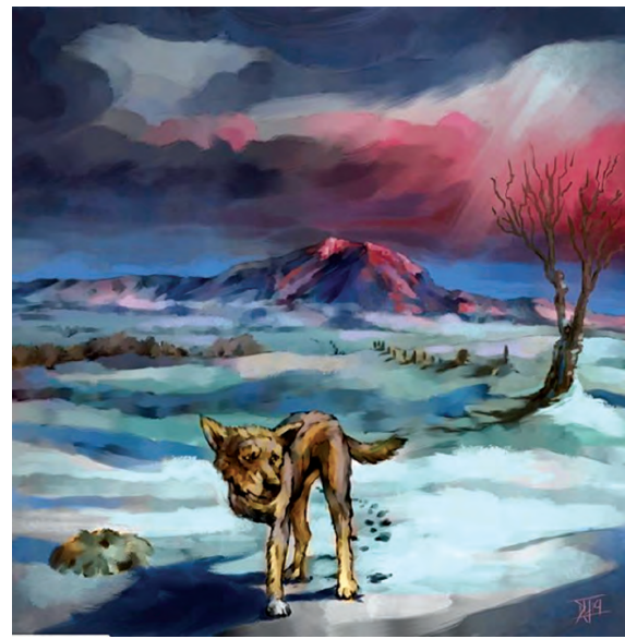
Dog Winter by Joseph Running Crane

If you're looking for a way to deepen in relaxation and self-care and want to check out a unique cross-roads of cultures in rural Montana, Norris is the place for you. For operating hours, menus and the complete music calendar,