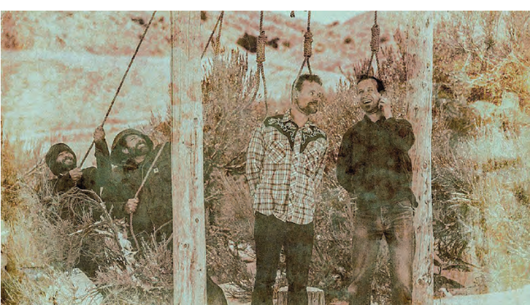
The Road Agents

Bozeman Hot Springs is located just south of Four Corners. Visit www.bozemanhotsprings.com for operating hours, further event details, and fitness membership information. •