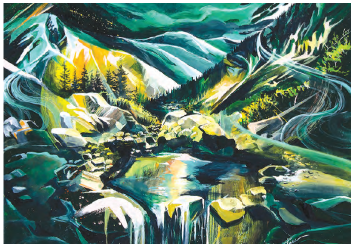
From "Moments of Infinity"

Learn more about these exhibits at www.theemerson.org .