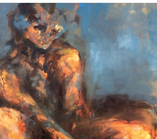
From "The Space Between"

These oft-tedious months when many have had enough of winter's grasp is perfect for enjoying some local artwork indoors. Three new exhibits have opened at the Emerson Center for the Arts & Culture and will remain on display into spring. Paint exhibitions "The Space Between"