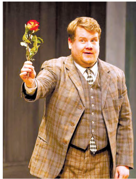
One Man, Two Guvnors

Wine, beer and other refreshments will be sold in the lobby one hour before each event. Ticketing and further information about these and other happenings is available at theellentheatre.org . For additional inquiries, call (406) 585-5885 or stop into The Ellen box office. Hours are Wednesday through Saturday from 1-3pm, as well as two hours prior to any event. •