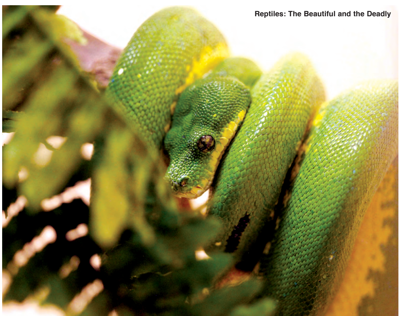
Reptiles: The Beautiful and the Deadly

Also at MOR, Reptiles: The Beautiful and the Deadly is now open. Reptiles have enduring appeal, and this interactive