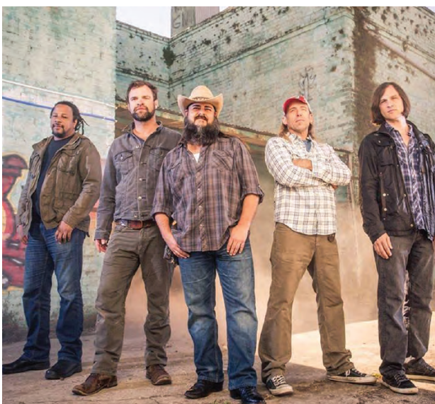
Honey Island Swamp Band

Town Center Park opens at 6pm for each Thursday concert, and there will be food and beverage vendors (including alcohol) and an arts activity tent for kids. Please be aware that NO dogs or glass containers are allowed in the park. Music typically starts at 7:15pm, but please visit www.bigskyarts.org for more information on these events. Further details about the summer lineup and other Arts Council happenings are also available through the website. •