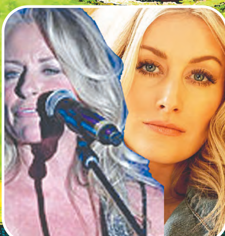
Women & Whiskey Dry Hills Distillery August 24th - 5:30pm