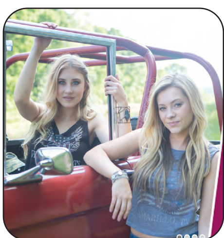
Big Sky Country State Fair July 18-24th County Fairgrounds