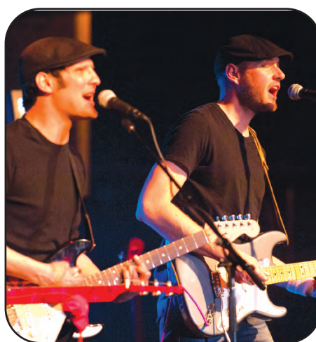
Pinky & The Floyd Pine Creek Lodge July 22 • 7:30pm