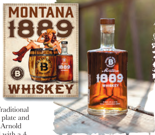
distilling processes, and other offerings at bozemanspirits.com/ . •

on its Montana roots. They currently have created two types of vodka, a gin and a whiskey, using Montana ingredients as much as possible. Each spirit is crafted with water sourced from the Hyalite, Sourdough, and Bozeman Creek watersheds, and all distilling and bottling occurs in the back room of the distillery. Bozeman Spirits Distillery uses two stills in the production area. An Artisan 300 Gallon Traditional Copper Pot Still with a 4 plate and 16 plate column, and an Arnold Holstein Copper Pot Still with a 4 plate column. Learn more about their spirits,