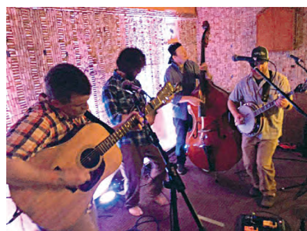
Gallatin Grass Project

Tap your feet and drink your brew! Make sure to get there early to get the package deal that includes 8 tasters of beer, polish dog, and limited edition commemorative glass featuring Bozeman Brewing. Individual beers and polish dogs are also for sale. Dance the night away with the