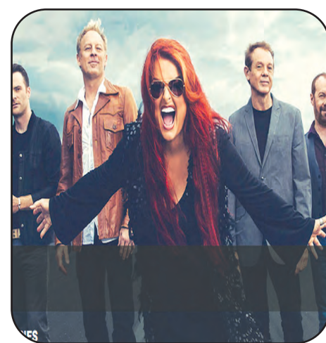
Red Ants Pants Festival White Sulphur Springs July 28 - 30th