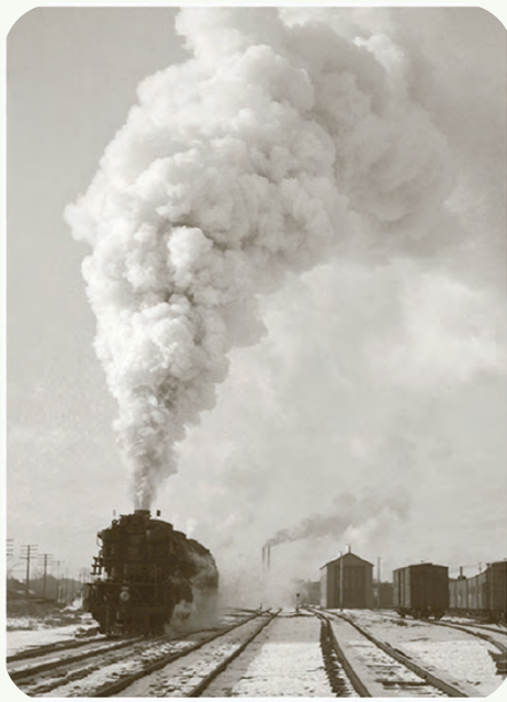
NP Passenger Extra 5120 leaving Missoula, Nov 1945

The Livingston Depot was originally built in 1902 and has been restored and is operated by the non-profit Livingston Depot Foundation. The Livingston Depot serves as a community cultural center promoting the visual and performing arts, culture, and history of the Yellowstone Region through its